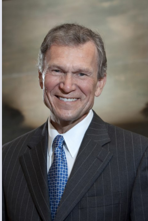
Senator Tom Daschle (D)